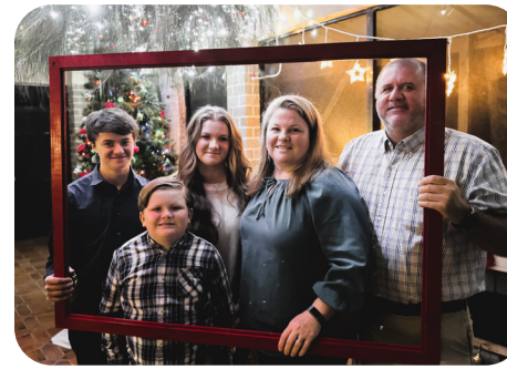
TMI Christmas party