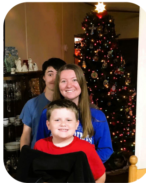
Christmas in Florida