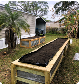
Raised Garden Beds